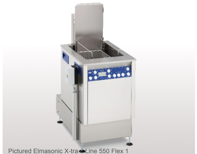
Pictured Elmasonic X-tra Line 550 Flex 1

Modular ultrasonic cleaning unit with oscillation device